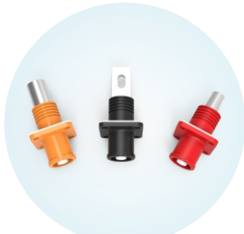
插座尾端接线方式有 螺纹、压接、Busbar三种可选 Three wiring method of socket tail