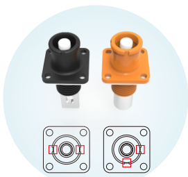
正负极防插错设计 Positive and negative mis-plug proof design